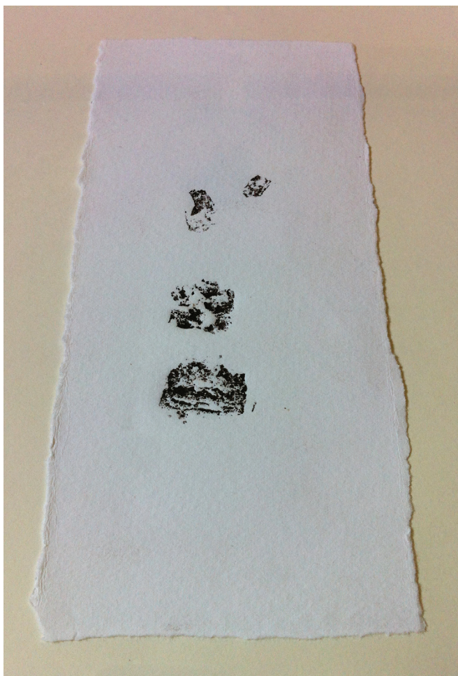
Pieza en Movimiento , monotyping on cotton paper, 8x20 cm, Mexico, 2012