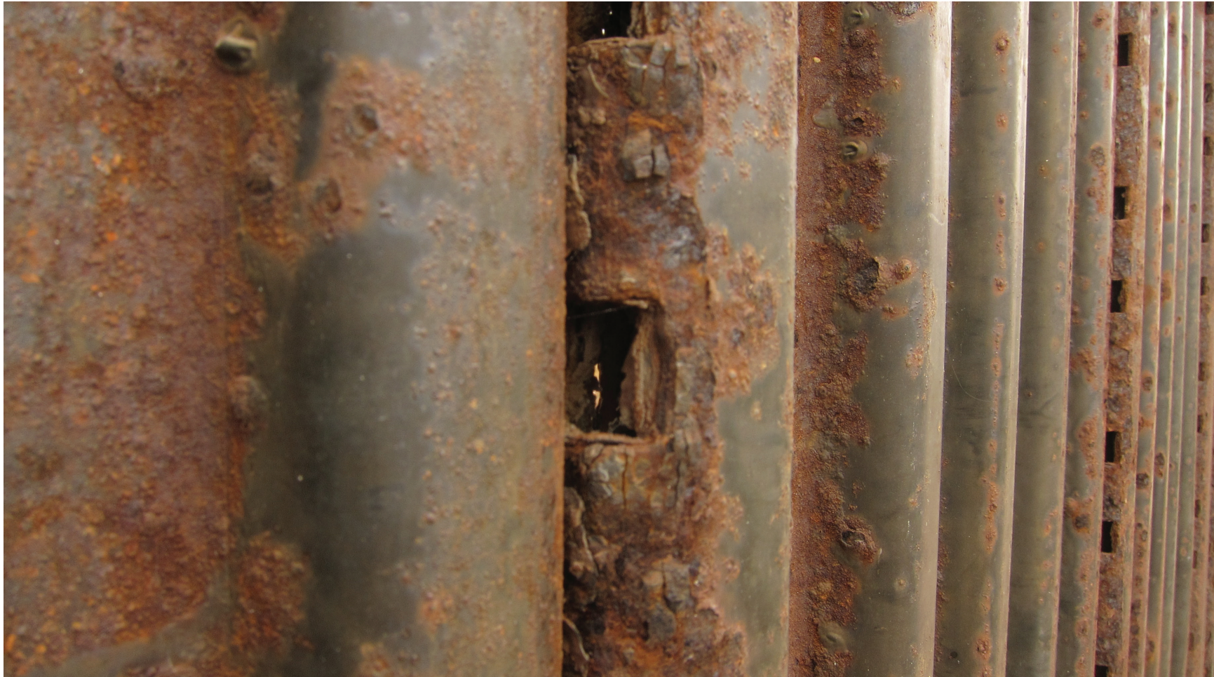
Photo Archive, recollecting pieces of border, Tijuana, 2011.