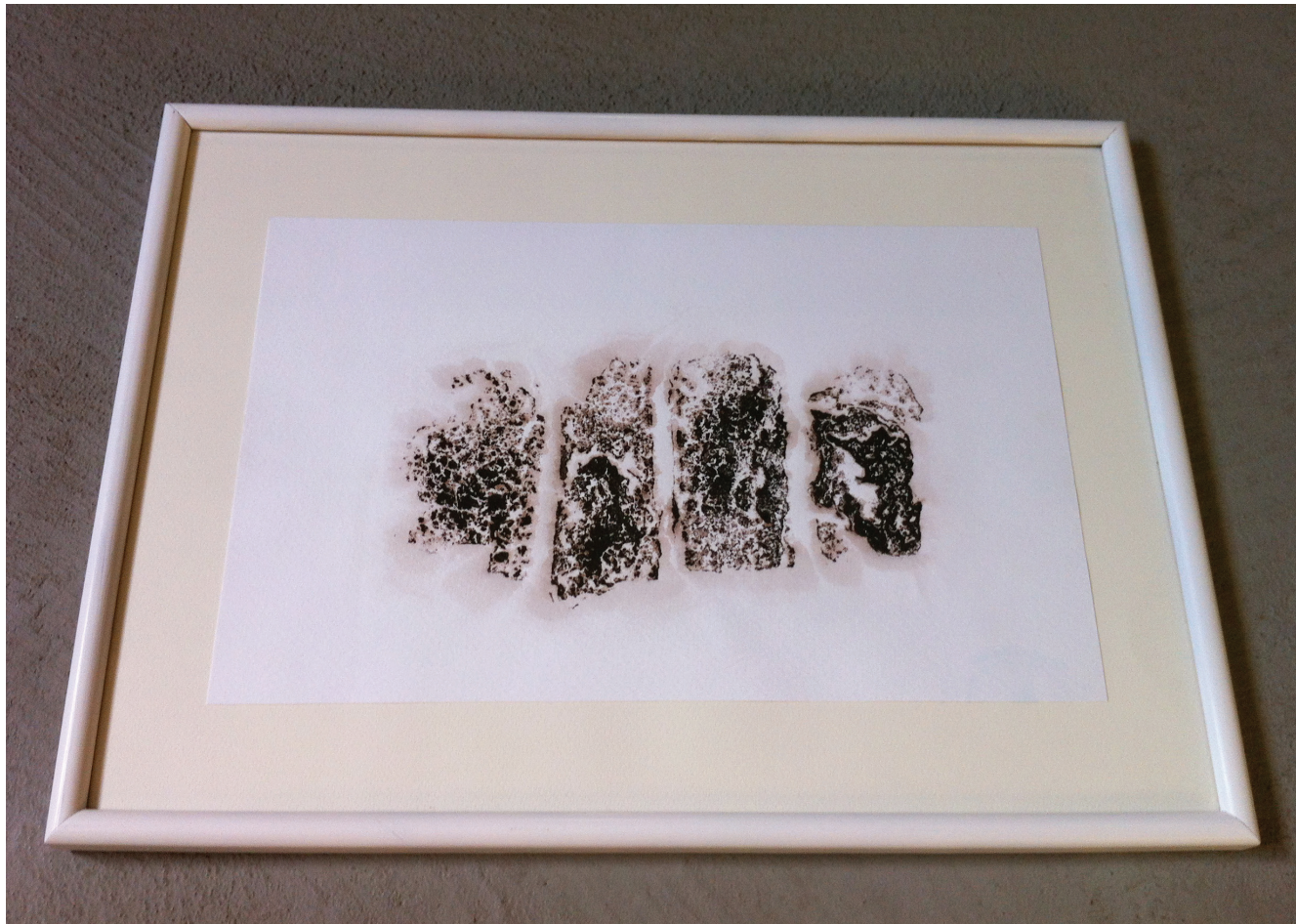
Cuatro , monotyping on cotton paper, 20x30 cm, Mexico, 2012